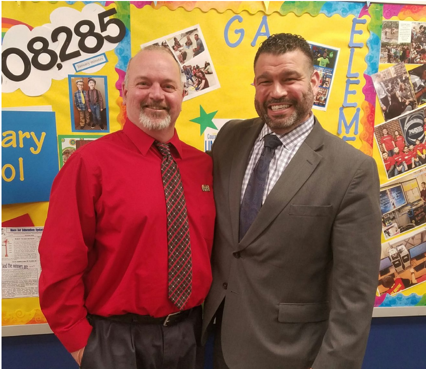
PA Secretary of Education, Pedro Rivera visits with GASD in 2016.

In 2015, the state Department of Education started engaging with communities around the state to learn what was important to them and to develop a new measure. As a result, in 2018 Pennsylvania reduced PSSA testing time by 20 percent, and established a new meaningful set of indicators.